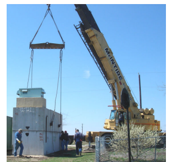
Students watched as our new emergency / tornado shelter was delivered.

It is very special gift from Oldcastle Precast of Mansfield.